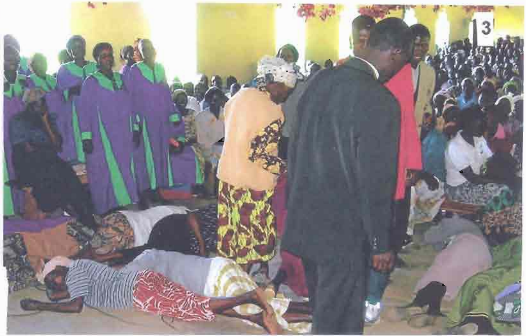
Top Left and Right: