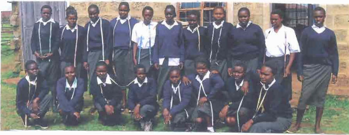
Left: The girls at the Keiro tailoring school who will be receiving new shoes.